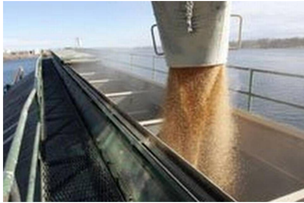
Figure 2: A barge is loaded with wheat grain