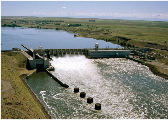
Figure 1: Ice Harbor Dam on the Snake River near Burbank, WA from U.S. Army Corps of Engineers. Ice Harbor Lock and Dam , nwd.usace.army.mil/Media/Images/igphoto/2000790239/