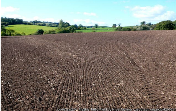
Figure 1: Tilled field from Mykura, Nigel. Freshly Tilled Field , geograph.org.uk/p/4200214