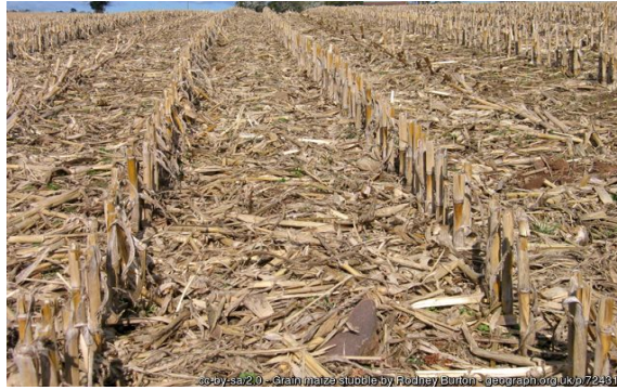
Figure 2: Crop residue from Burton, Rodney. Grain Maize Stubble , geograph.org.uk/p/724310

No-till or direct seeding is a farming practice that skips the conventional step of tilling before planting seeds in the ground. The ground in figure 1 has been tilled - the soil has been broken up and turned over to remove weeds and leftovers from last season's harvest and prepare the field for planting new seeds.